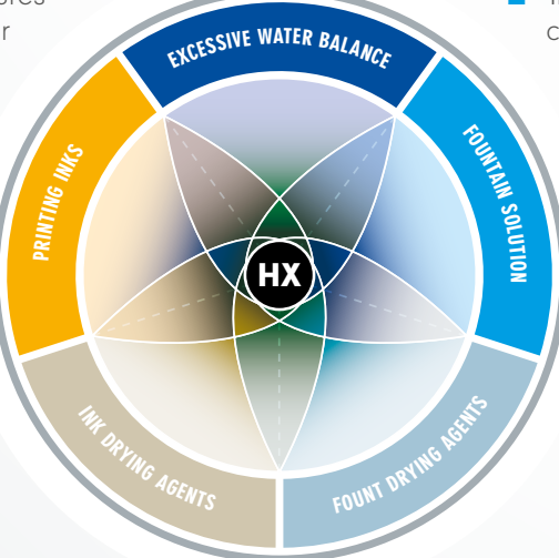
Fig. 4: OXIGRAPH

Rollers should be stored in a way that avoids deformation of, or mechanical damage to, the roller covering; ideally, standing or suspended on the shafts. For storage, cleaning and maintenance of rubber products, the ISO 2230 standard applies.